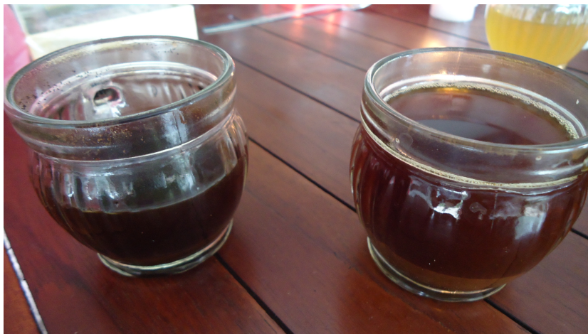
The Kopi Luwak is on the right and only cost me 30,000 rupiah or about $2.50 CAD

Regardless of whether the civet picks only the best and ripest coffee cherries, the added breakdown and enzymes makes it smoother on the stomach or the extravagant price and global marketing, Kopi Luwak definitely has its own unique flavor. Before you drop the cash or hike a volcano for this cuppa kopi though, I would consider just feeding a few coffee beans to your cat first.