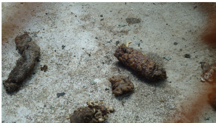
Kopi Luwak Coffee in the making or, uh, after the making

I sit down at one of the local plantations, south of Mount Batur, for a taste test. The farmer serving us happily explains that the whole concept of Kopi Luwak came from strained resourcefulness rather than some gimmick marketing scheme. The animal would eat all the berries some seasons and leave the farmers with nothing to harvest. I could only imagine the farmer's son who might as well have announced: 'Let's roast this shit and sell it to white people for $300 a pound Dad!'