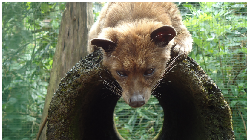
The Balinese Luwak (Civet cat) and I having a stare down

The civet is a Balinese cat known locally as the luwak and is closely related to the weasel family. The villagers let the animal roam the coffee plantations to eat the coffee berries and then pick out the partly digested coffee beans from the animal's feces. What you get is 'Cat Poo Coffee' produced annually in small amounts that can go for as much as $75 (CAD) per espresso in London. [Proof ( http://www.metro.co.uk/news/139241-cat-poo-coffee-costs-50 )]